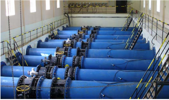
The large pipe size of this irrigation pumping station made the Sonokit with SITRANS FUS060 transmitter a highly cost-effective choice for flow measurement.